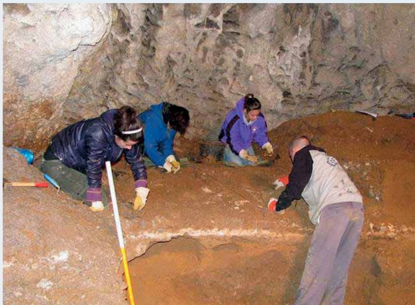
Excavations at Bukovac Pećina (Cave), 2010.