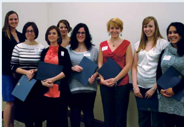
2012 Lambda Alpha inductees