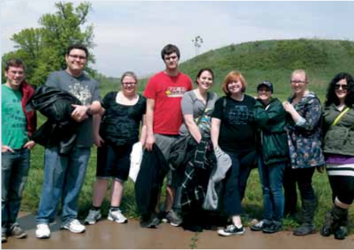
SOSA members on the Cahokia trip.

In mid-November, SOSA celebrated our second Non-Traditional Thanksgiving, where members brought a cornucopia of food items that would not be found at the typical Thanksgiving table. "Bad Anthro Movie Nights" were held once each month, where members enjoyed some really entertaining, but not anthropologically accurate, films.